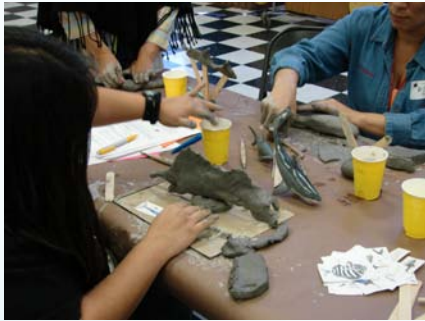
Sculpt a fish.