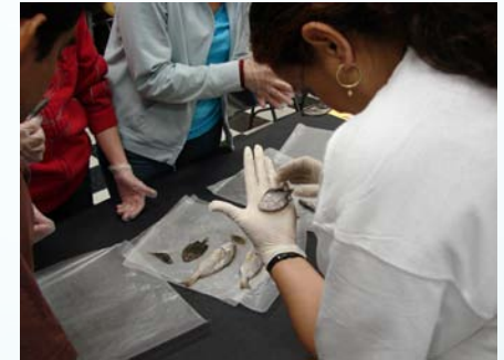
Learn to categorize a fish based on body morphology